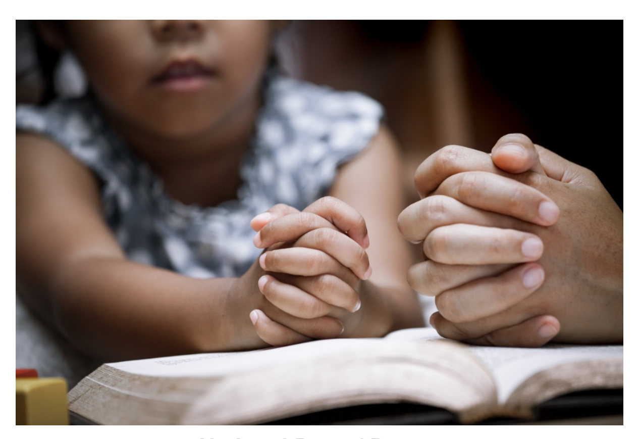
National Day of Prayer

"Be joyful in hope, patient in affliction, faithful in prayer."